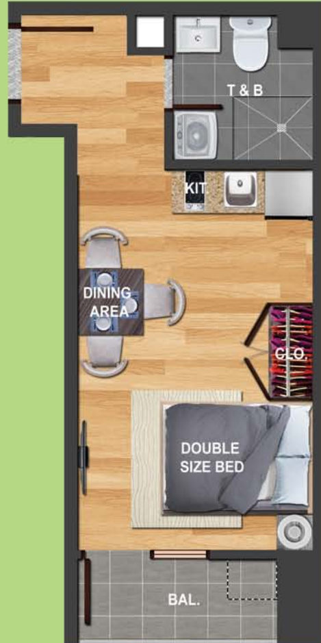
Studio Unit E 27 sq. m.