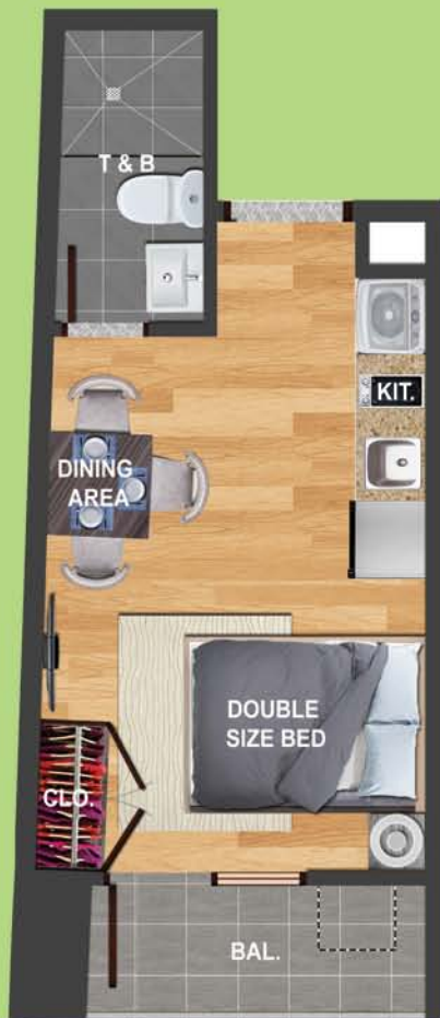
Studio Unit H 24 sq. m.