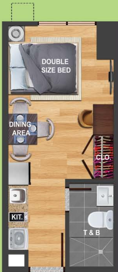
Studio Unit F 20 sq. m. 22 sq. m. (with balcony)