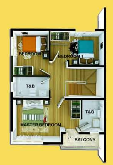
Single Detached Floor area: 75 sq.m. Lot area: 92 sq.m.