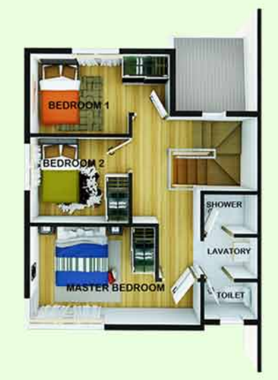
Duplex Floor area: 71 sq.m. Lot area: 92 sq.m.