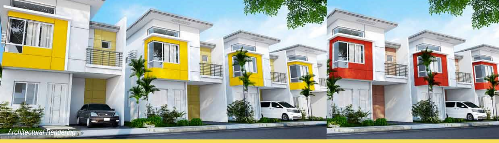
Color options of Yellow and Red.