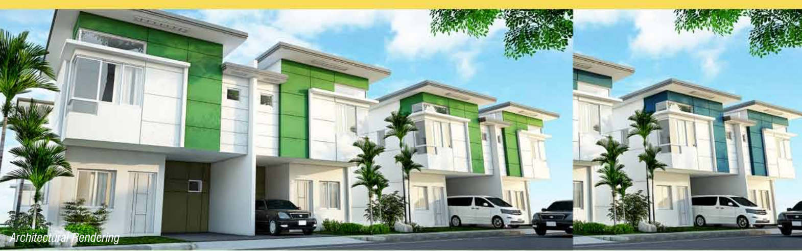
Color options of Green and Blue.