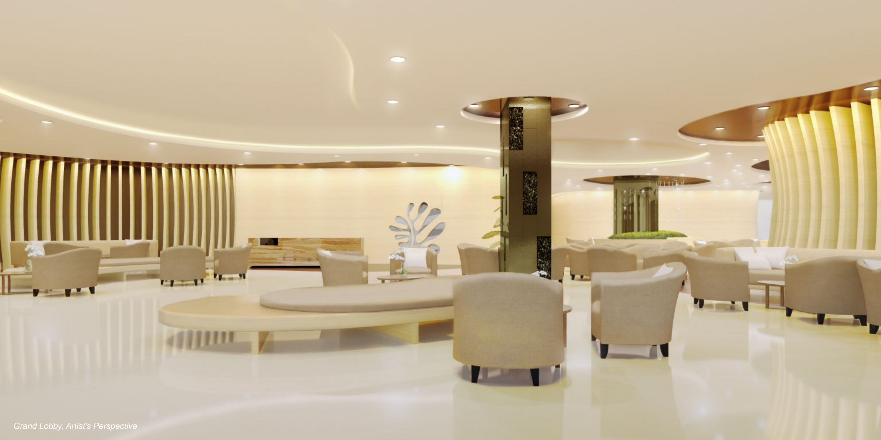
Grand Lobby, Artist's Perspective