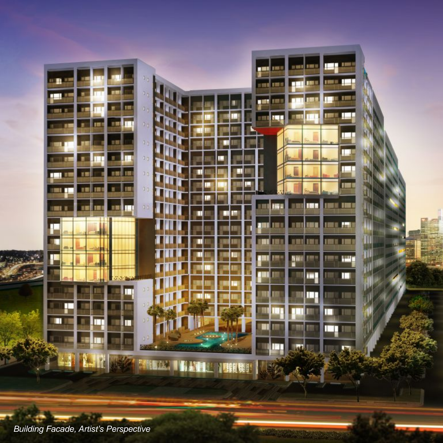
Building Facade, Artist's Perspective