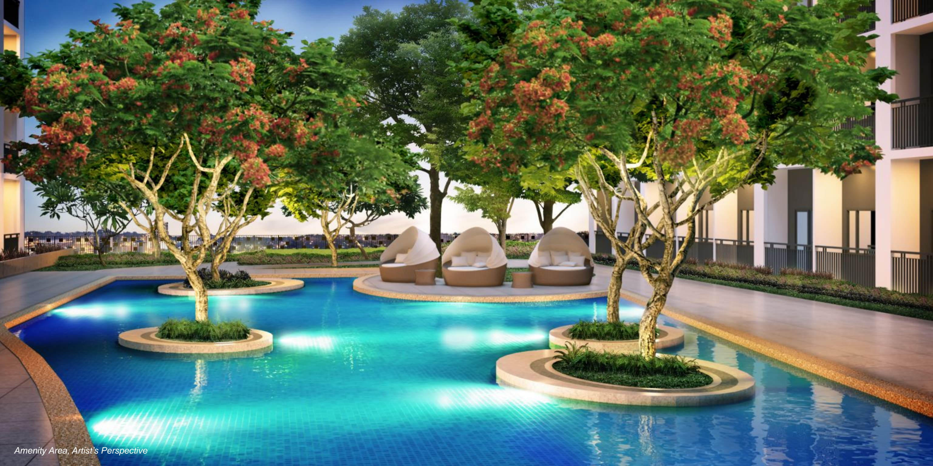
Amenity Area, Artist's Perspective