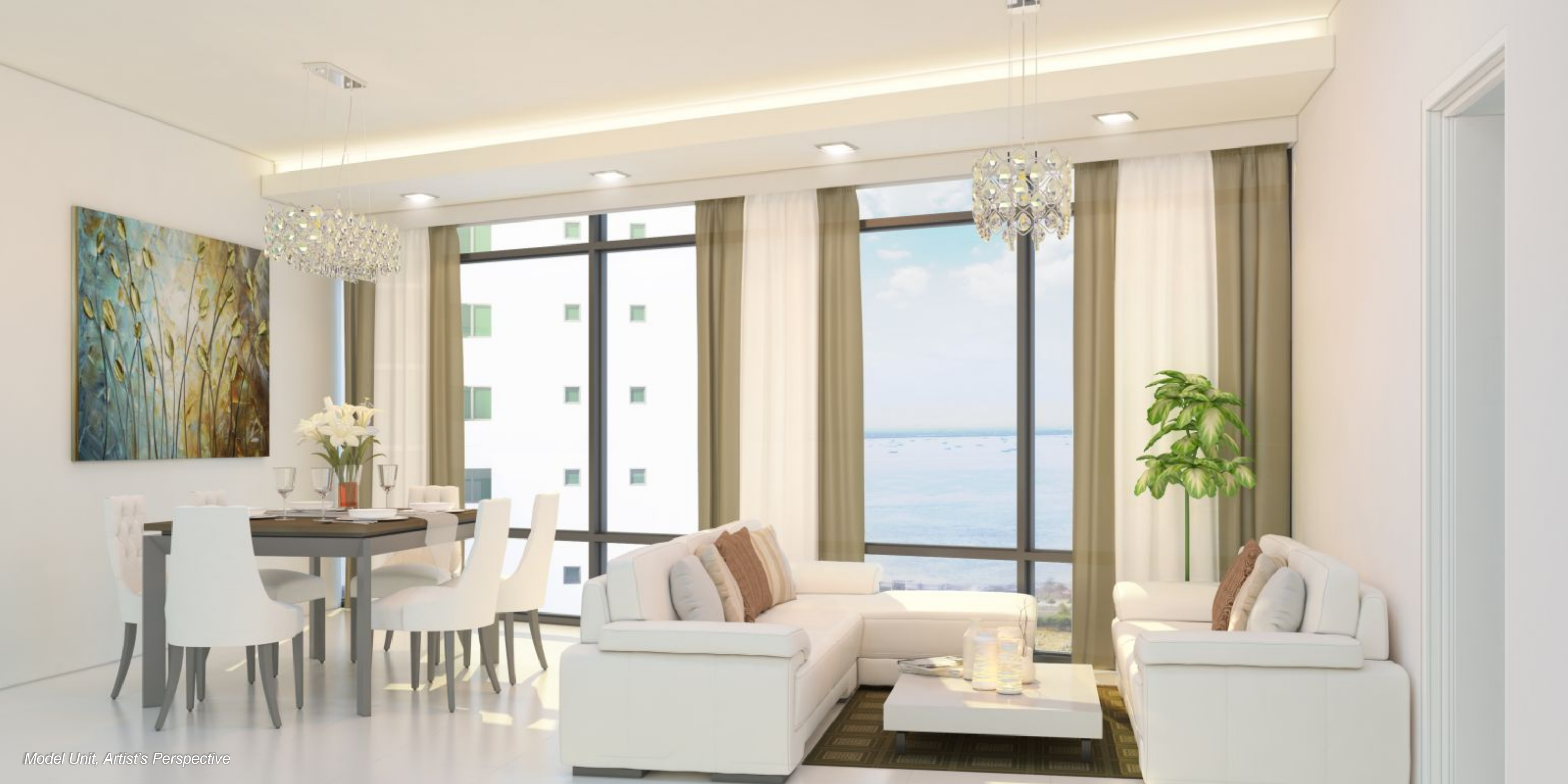
Model Unit, Artist's Perspective