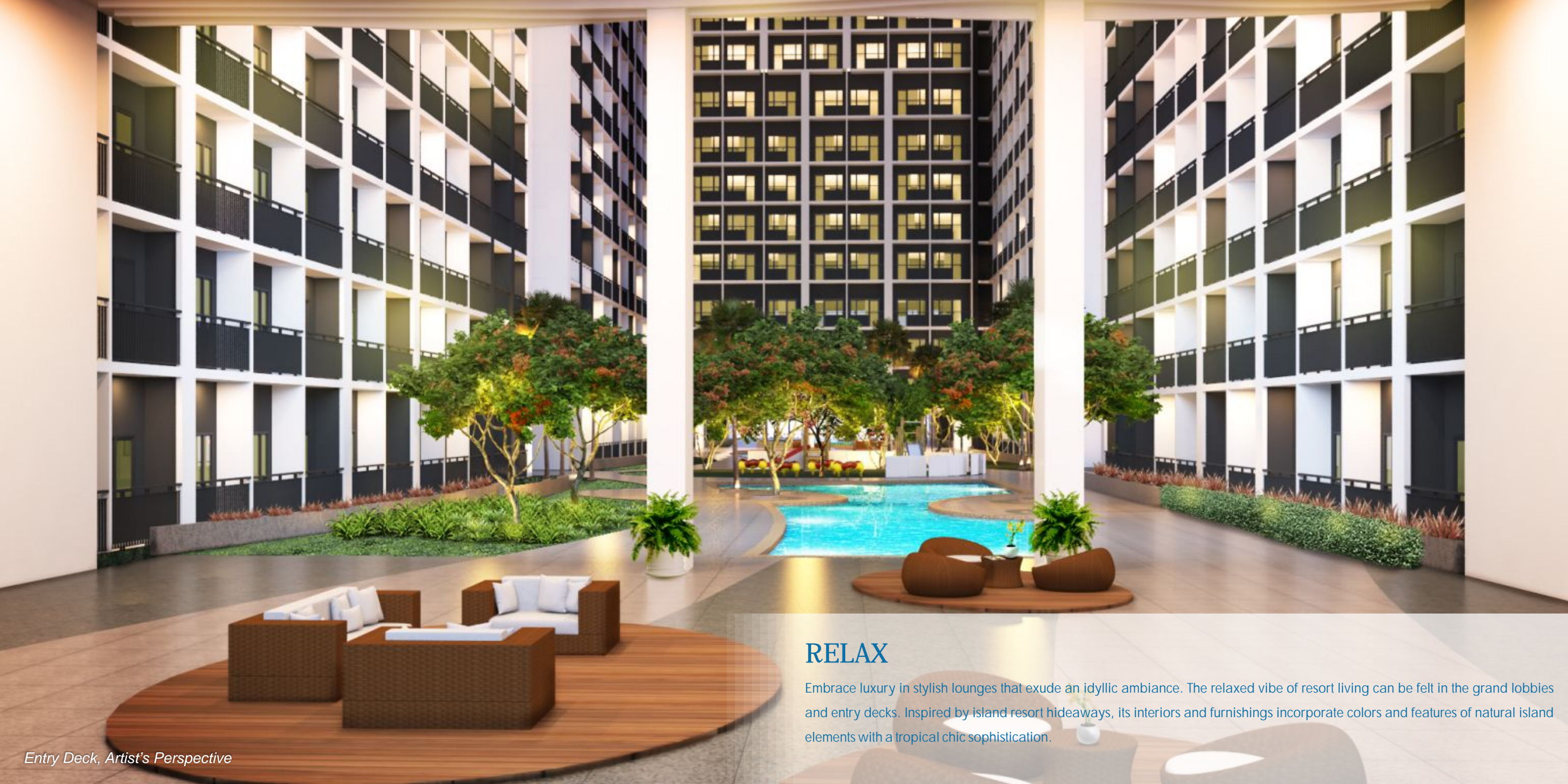
Entry Deck, Artist's Perspective