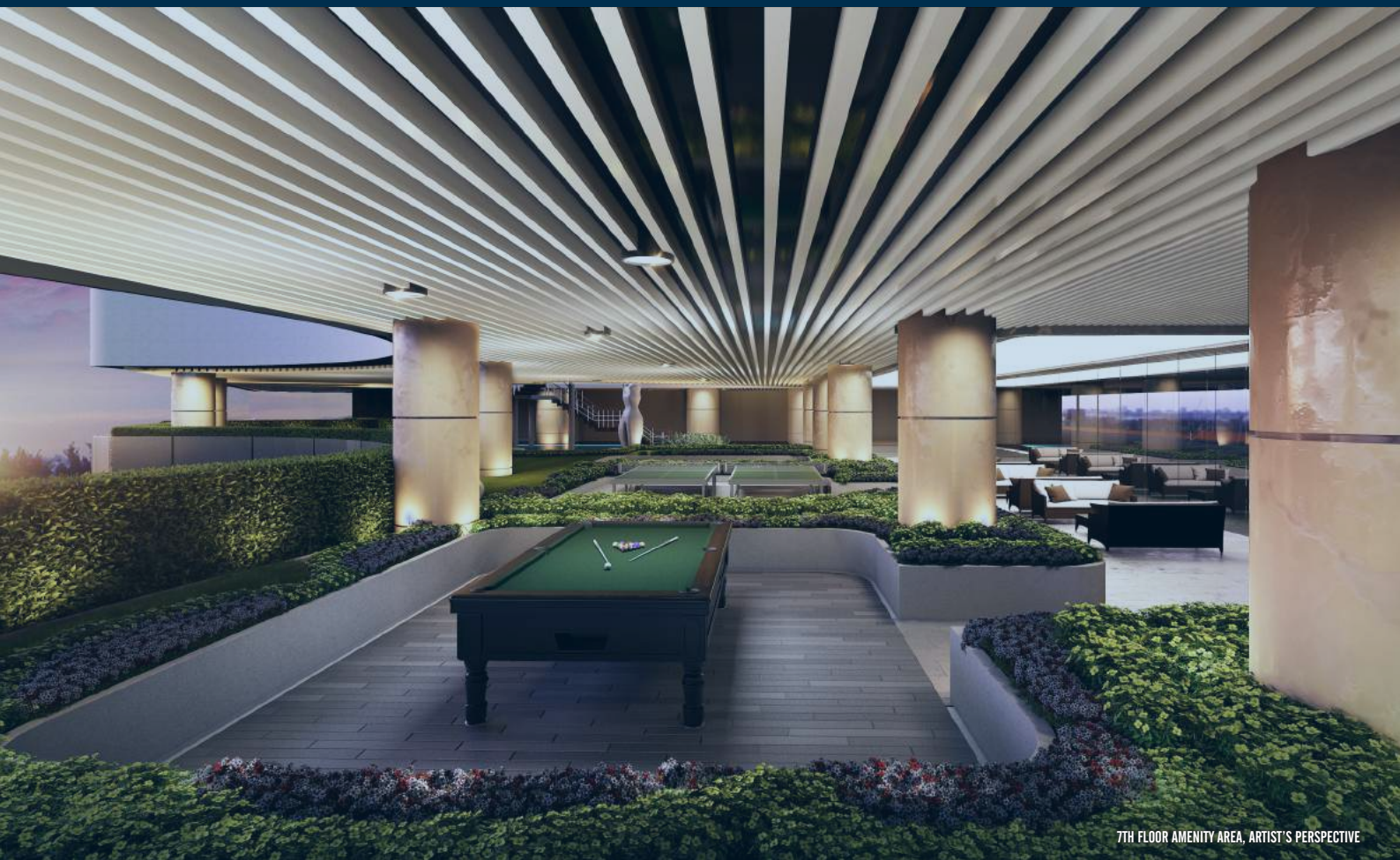
7TH FLOOR AMENITY AREA, ARTIST'S PERSPECTIVE