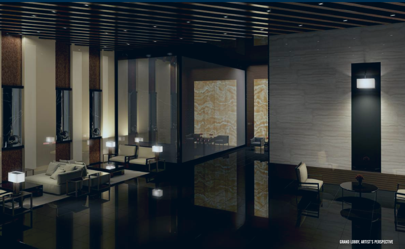
GRAND LOBBY, ARTIST'S PERSPECTIVE