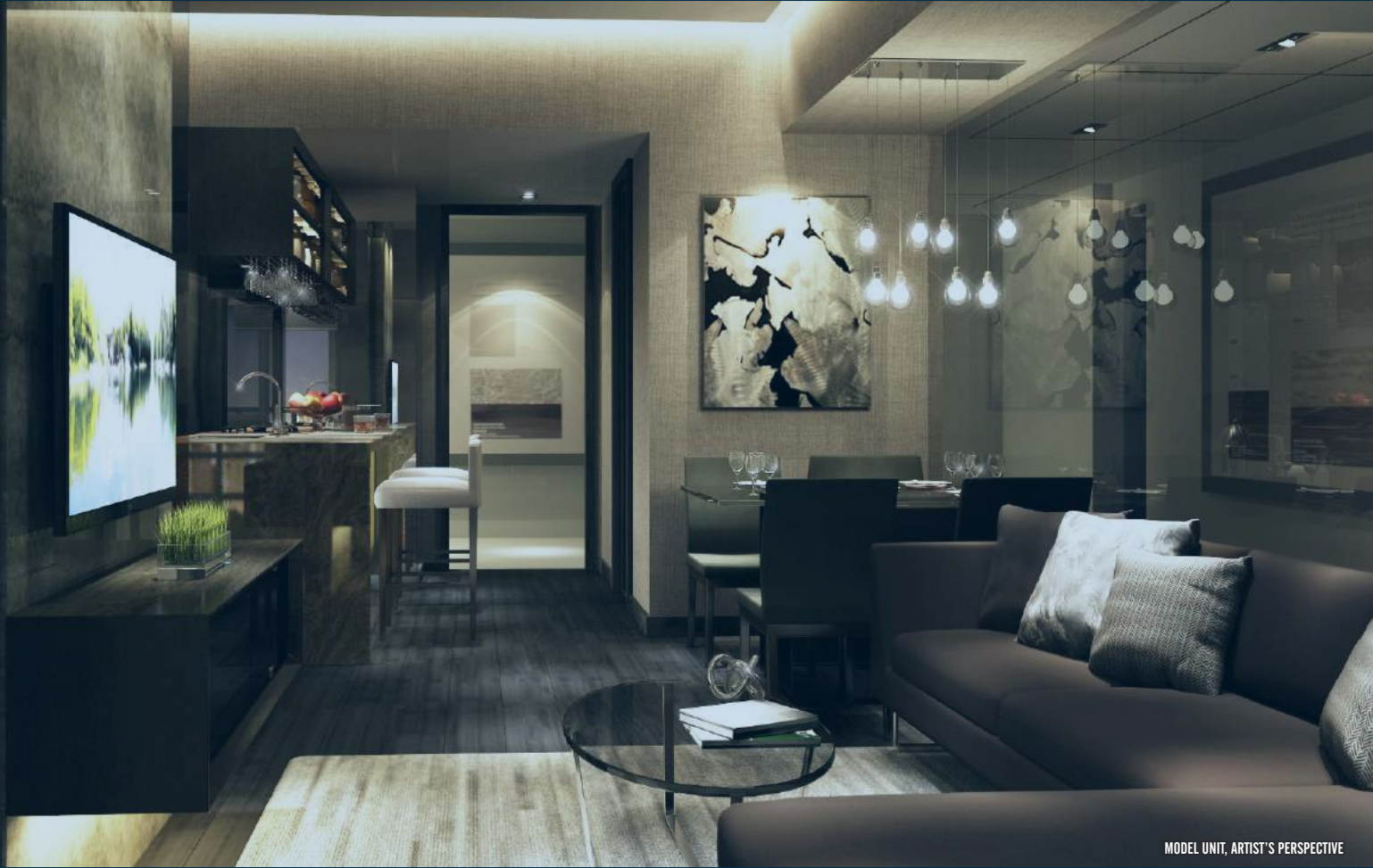
MODEL UNIT, ARTIST'S PERSPECTIVE